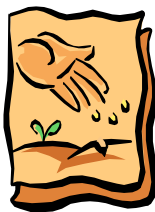
Plant 2-3 seeds per hole 1ft apart.