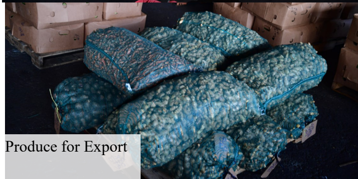
Produce for Export