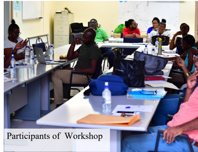
Participants of Workshop