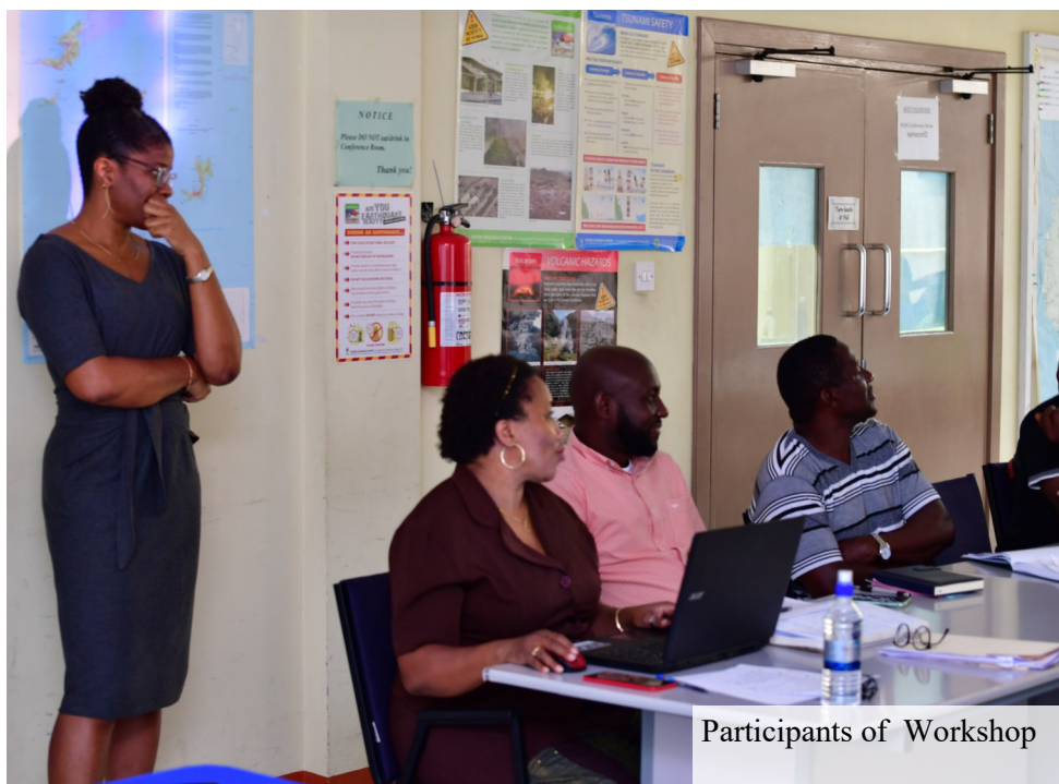
Participants of Workshop