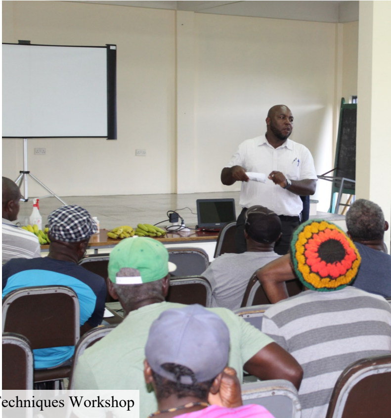
Banana Ripening Techniques Workshop