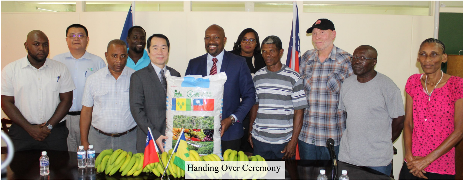
Handing Over Ceremony