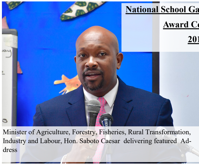
Minister of Agriculture, Forestry, Fisheries, Rural Transformation, Industry and Labour, Hon. Saboto Caesar delivering featured Address