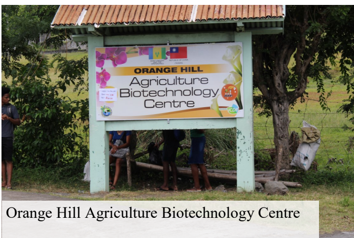
Orange Hill Agriculture Biotechnology Centre