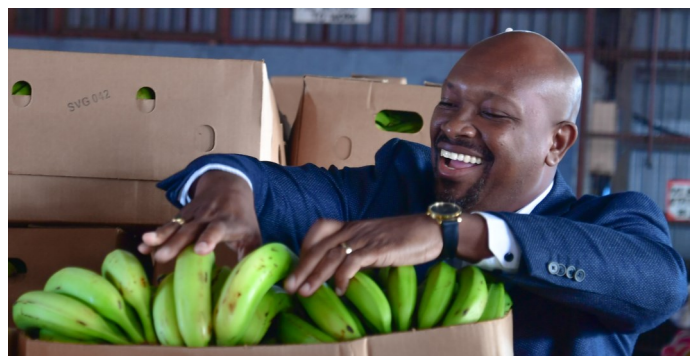
Minister of Agriculture, Forestry, Fisheries, Rural Transformation, Industry and Labour, Hon Saboto Caesar

Minister Caesar also mentioned that efforts are being made to decrease the importation of processed foods. He noted that this shipment consisted of the largest quantity of turmeric to have ever been exported. (Turmeric is a potent anti-inflammatory and antioxidant which helps to pre-