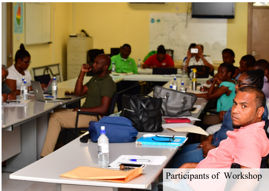
Participants of Workshop