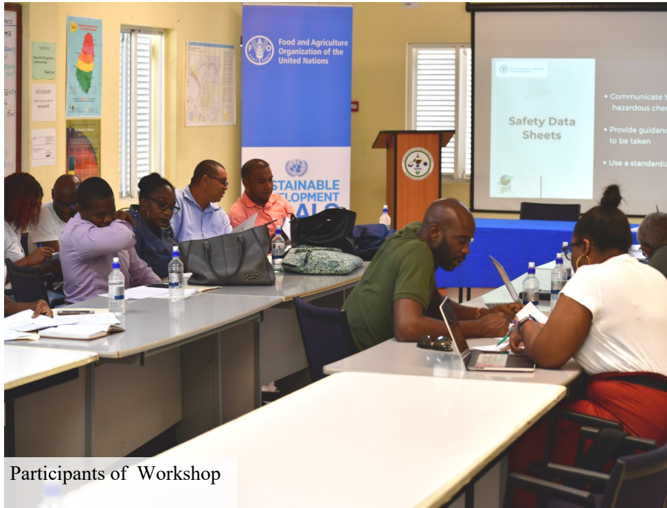
Participants of Workshop